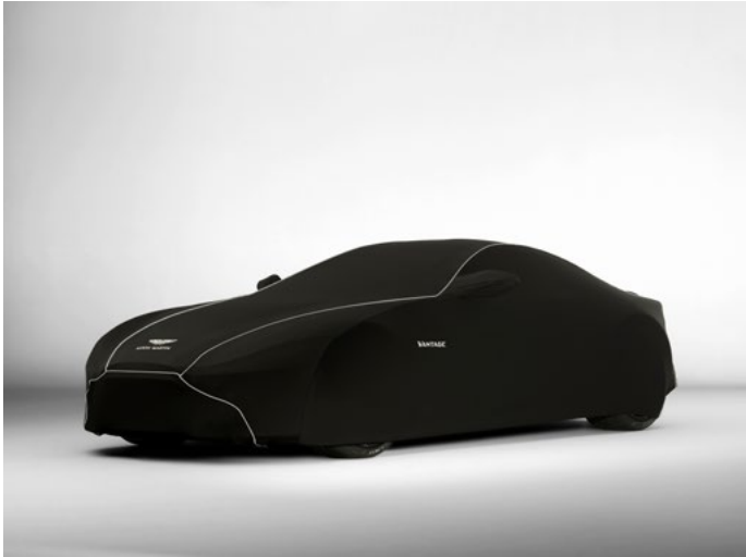
*Image shows a standard black indoor car cover as a visual representation

Vantage deserves to be looked after. So help keep your car in flawless showroom condition with one of our Vantage Indoor Car Covers. Each cover is a fully tailored and made in a soft mix with a protective fleece lining. The yarn has been dyed to prevent fading and the breathable material allows moisture to evaporate. Supplied with a storage bag and available in a range of fabric and trim options.